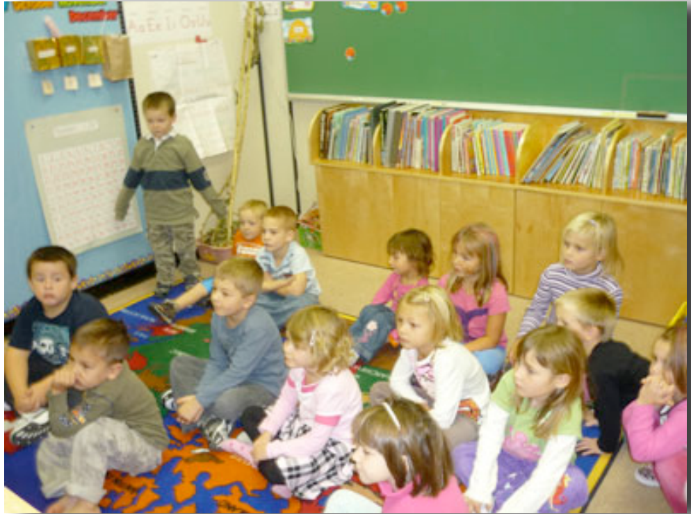
StrongStart Kids Visited Kindergarten Tuesday Afternoon