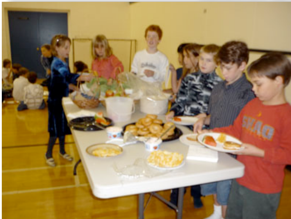
Students Ate Breakfast Together After Wednesday's iWalk to Breakfast

Thursday - October 8, 2009 ◆ www.sd51.bc.ca/cles