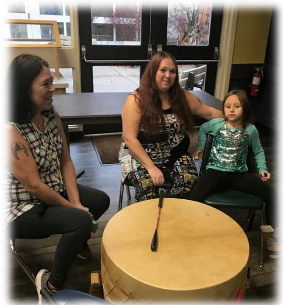
Louis Riel Day at GFSS – 3 Generations of drummers

June 9 – Budget Meeting #6 – Approval of Budget 2020-21