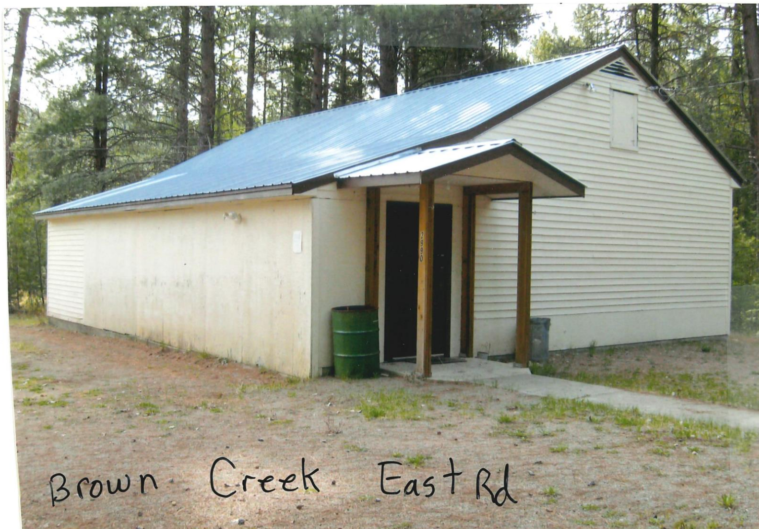
Brown Creek East Rd