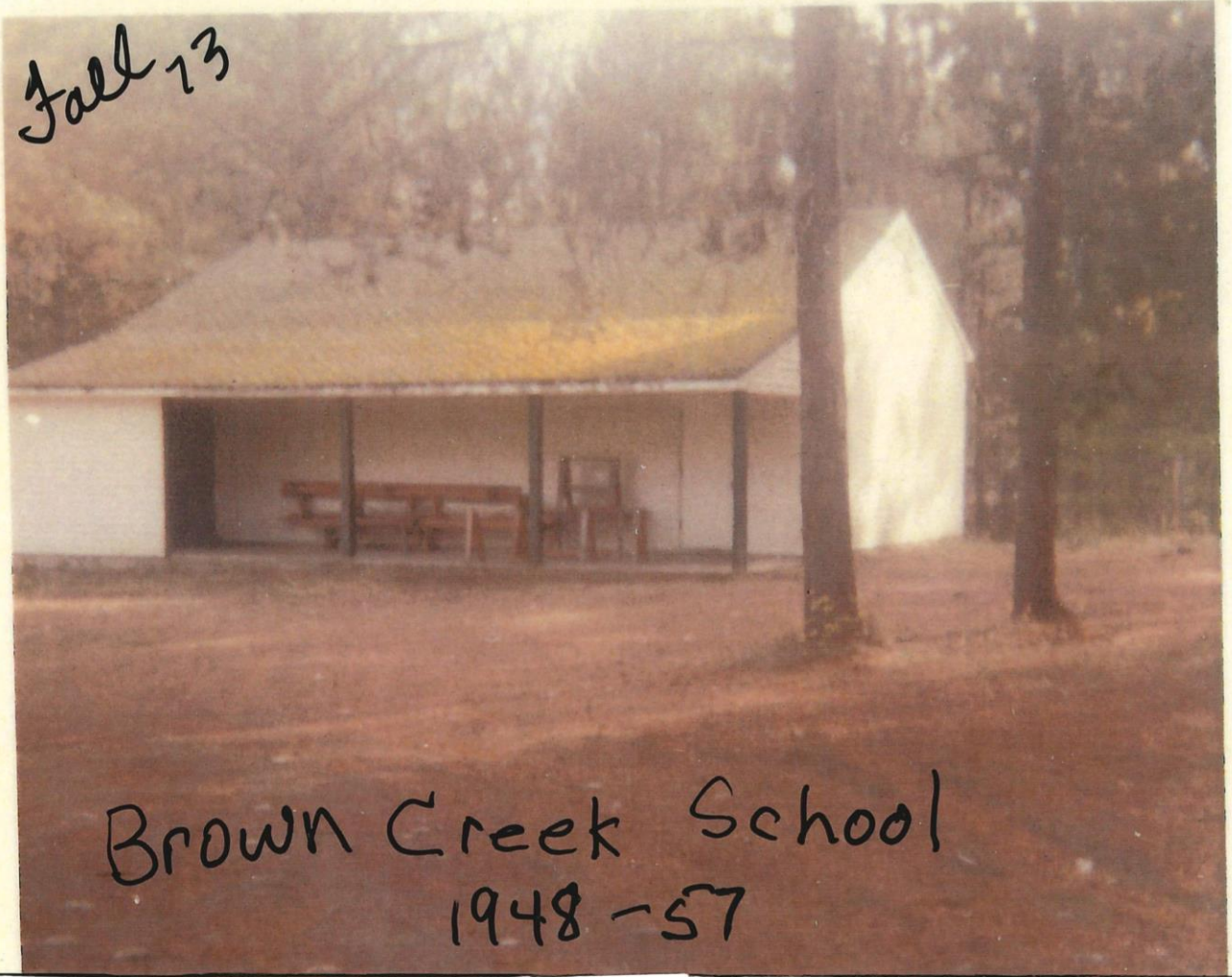
Brown Creek School 1948-57