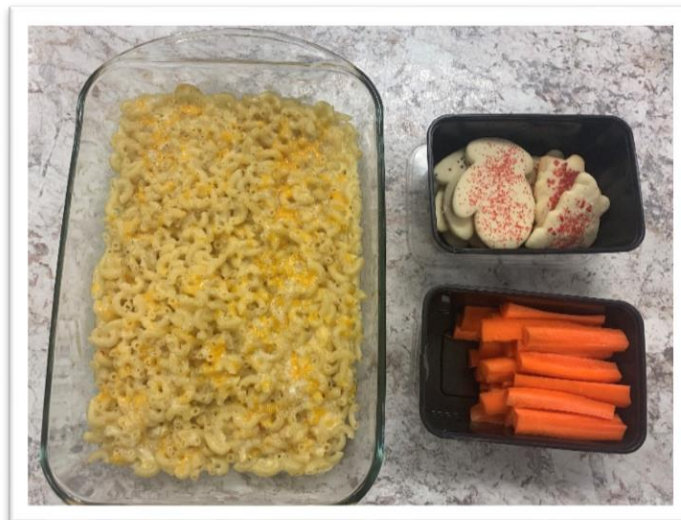
Lunches for MES students made by BCSS Foods students