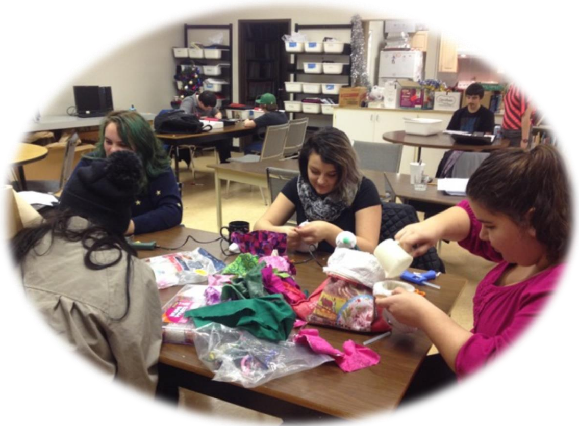
Making Christmas Decorations at Walker Development Centre