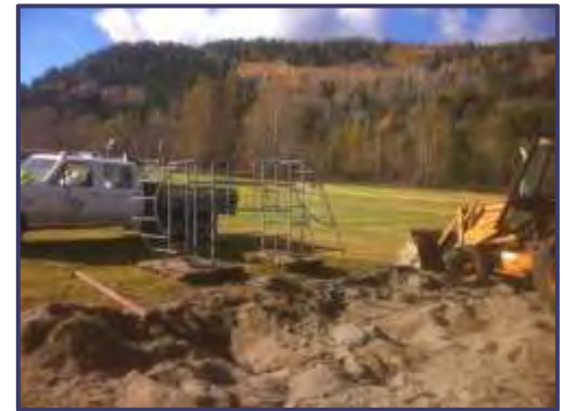
Playground Prep – Greenwood Elementary