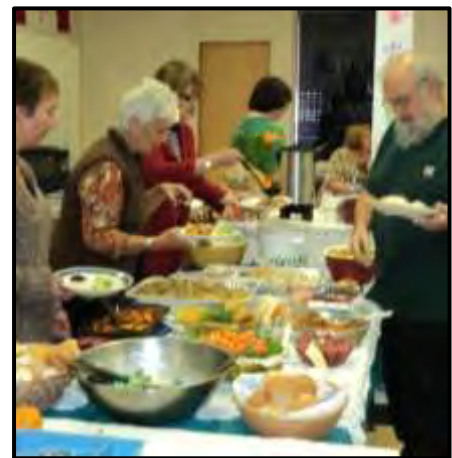
Harvest Lunch at Walker